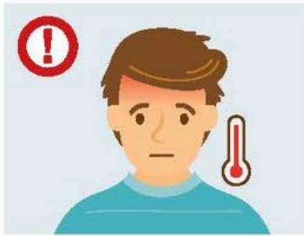
A high temperature