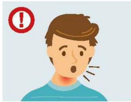
A new continuous cough