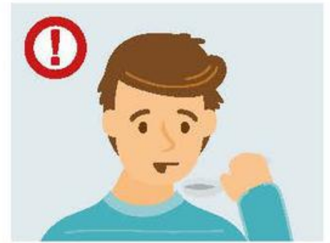
A change to or loss of your sense of taste and smell.

If you have ANY symptoms of COVID-19 you should follow these steps